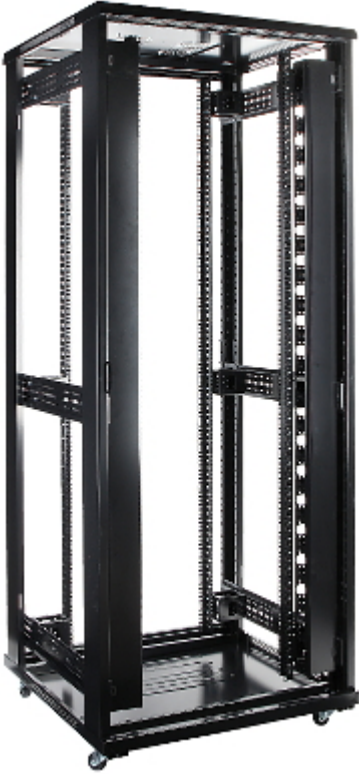
Side view (no mounted sides and back cover):