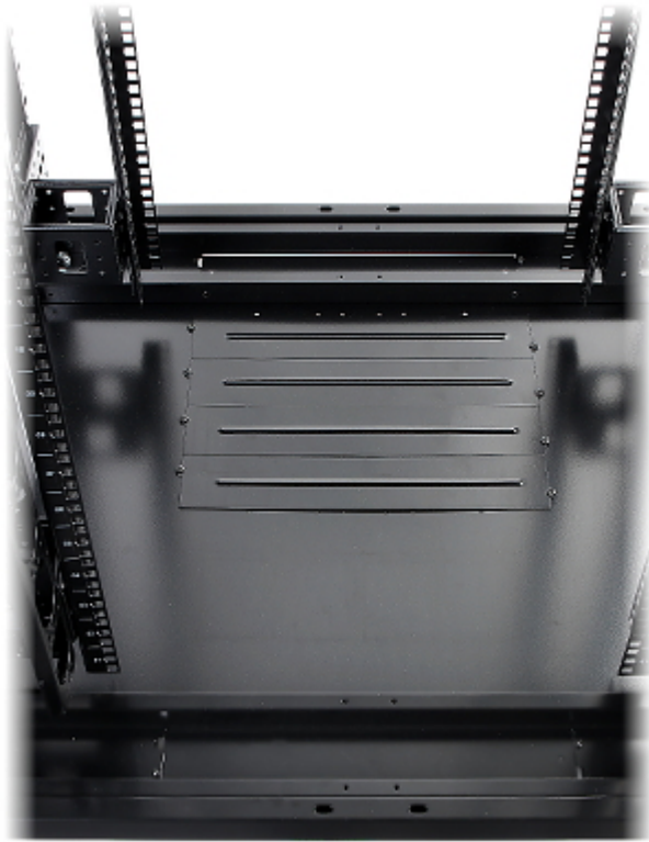
Holes for fan coolers: