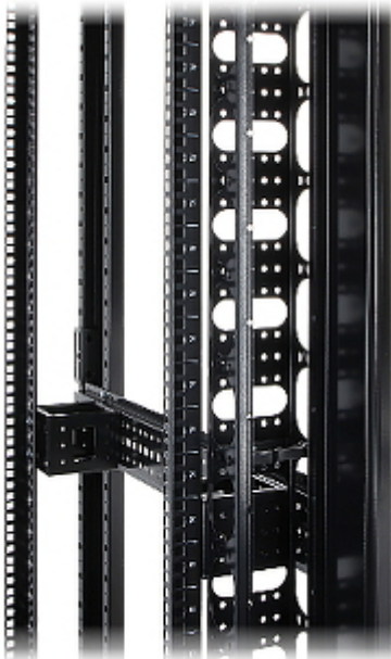
Cable entry in the base with dimensions of 380 x 280 mm: