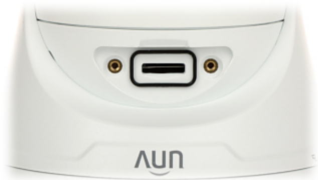
Camera is out from clamping ring: