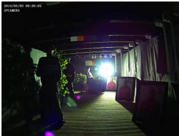
Record from camera during daylight operation: