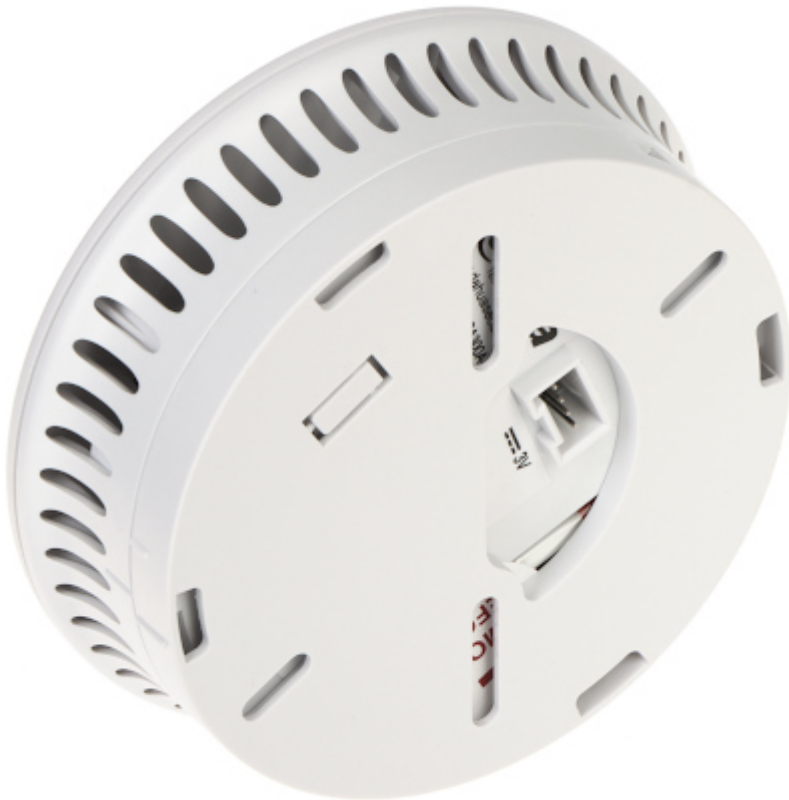
View after removing the back panel: