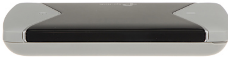
micro USB connector: