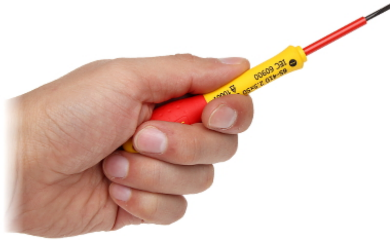
Example of application: