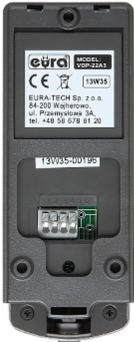
Monitor mounting side view: