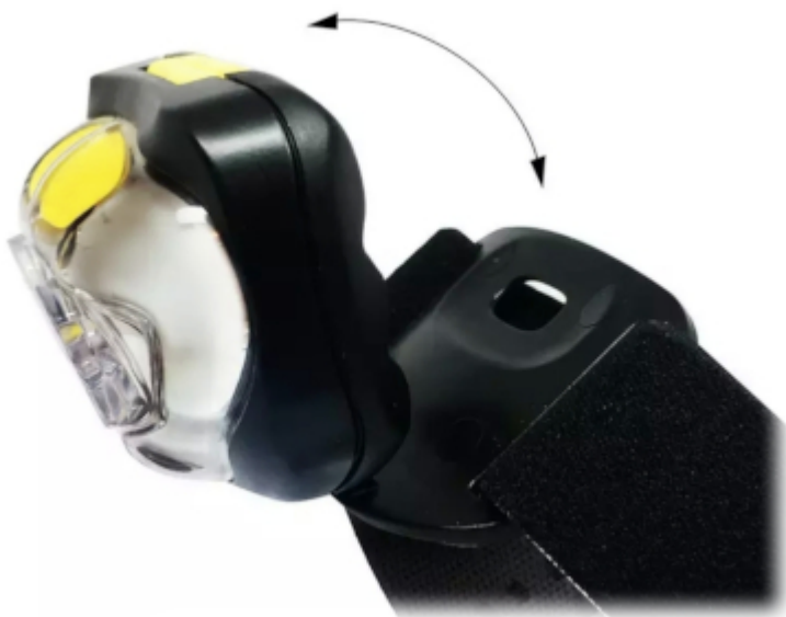
Examples of lighting modes: