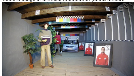
Camera image at artificial illumination (about 30Lux):

DELTA-OPTI Monika Matysiak; https://www.delta.poznan.pl POL; 60-713 Poznań; Graniczna 10 e-mail: delta-opti@delta.poznan.pl; tel: +(48) 61 864 69 60