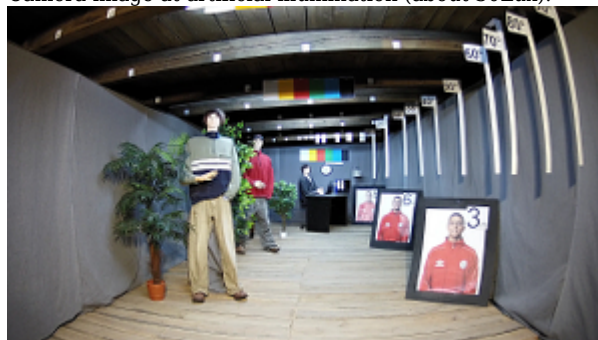
Camera image at artificial illumination (about 30Lux):