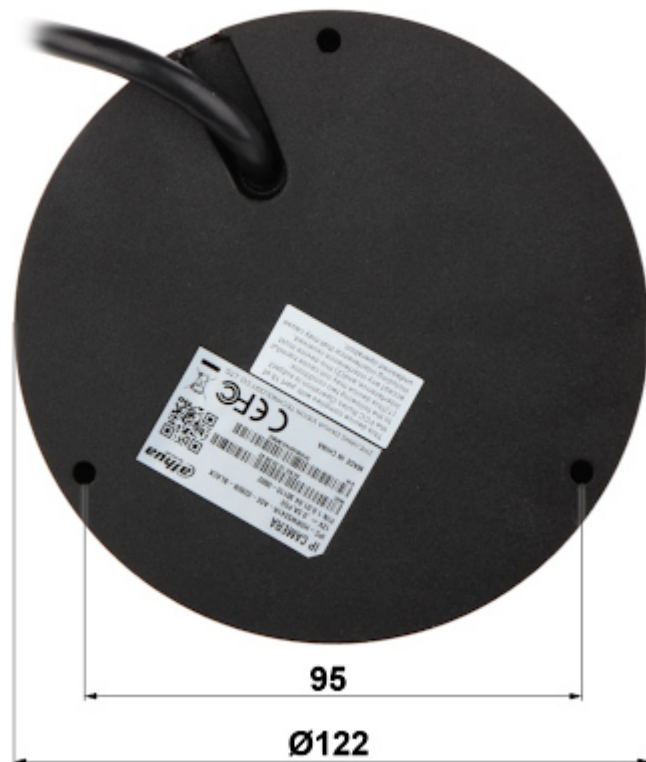
See how to initialize DAHUA cameras: