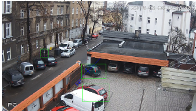
Camera image at artificial illumination (about 30Lux):