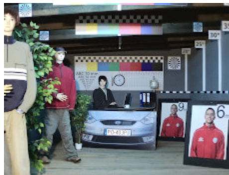
Camera image at night conditions with internal built-in IR illuminator on: