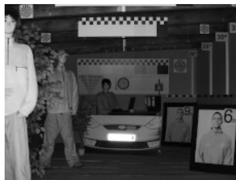
Camera image at direct strong light opposite to camera: