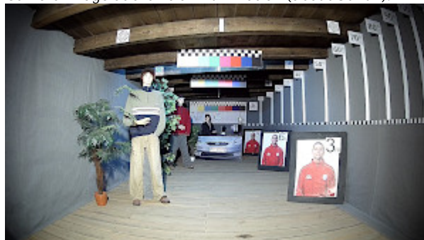
Camera image at artificial illumination (about 30Lux):