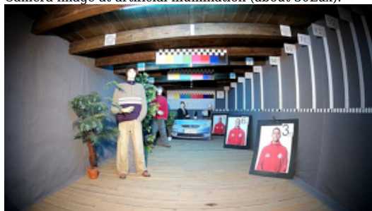
Camera image at artificial illumination (about 30Lux):

DELTA-OPTI Monika Matysiak; https://www.delta.poznan.pl POL; 60-713 Poznań; Graniczna 10 e-mail: delta-opti@delta.poznan.pl; tel: +(48) 61 864 69 60