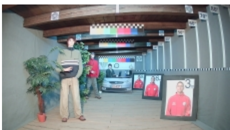
Camera image at artificial illumination (about 30Lux):