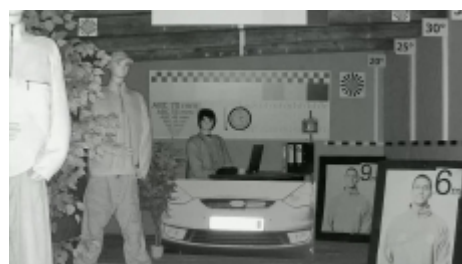
Camera image at direct strong light opposite to camera: