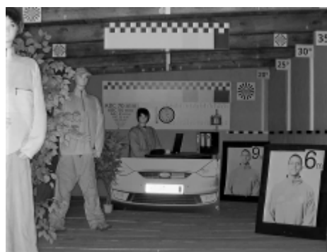
Camera image at direct strong light opposite to camera: