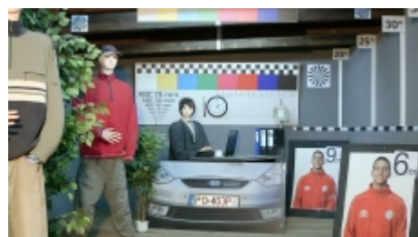
Camera image at night conditions with internal built-in IR illuminator on: