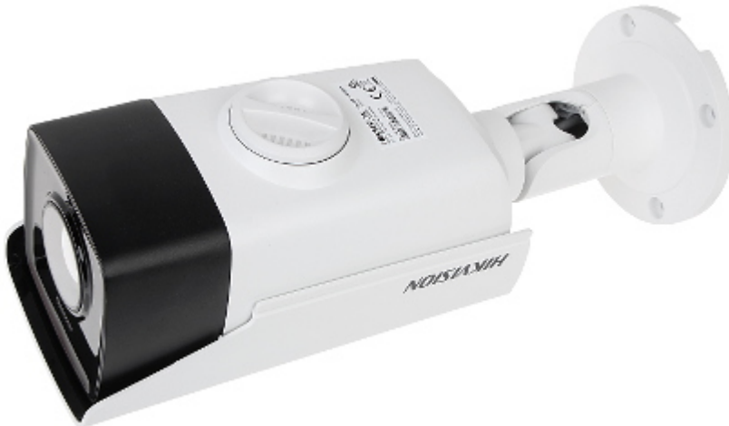
Bottom view (control panel):