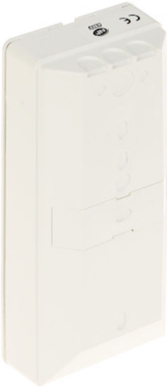
Detector inner view: