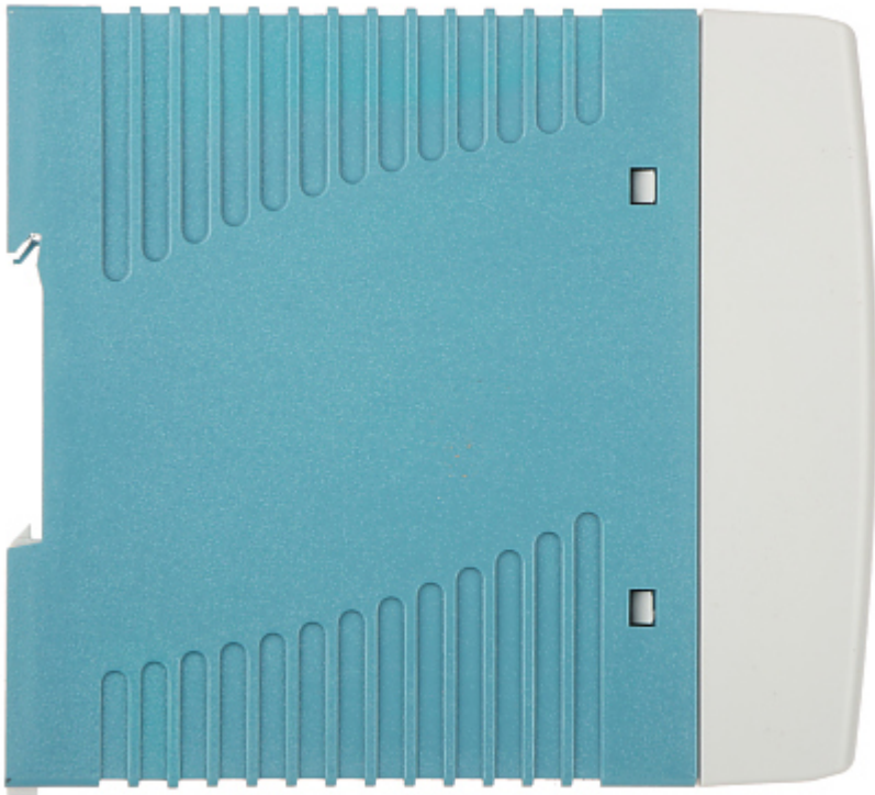
Rear panel (DIN rail installation):