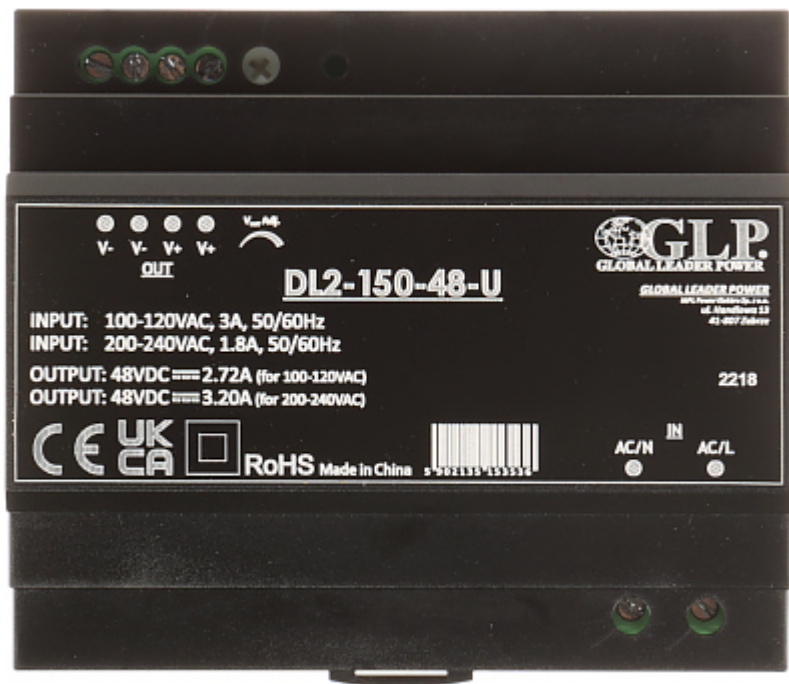
Rear panel (DIN rail installation):