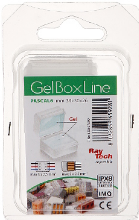
Example of application: