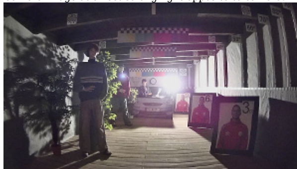
Camera image at night conditions, at different illumination values show below: