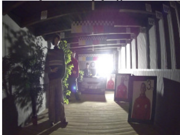
Camera image at night conditions, at different illumination values show below: