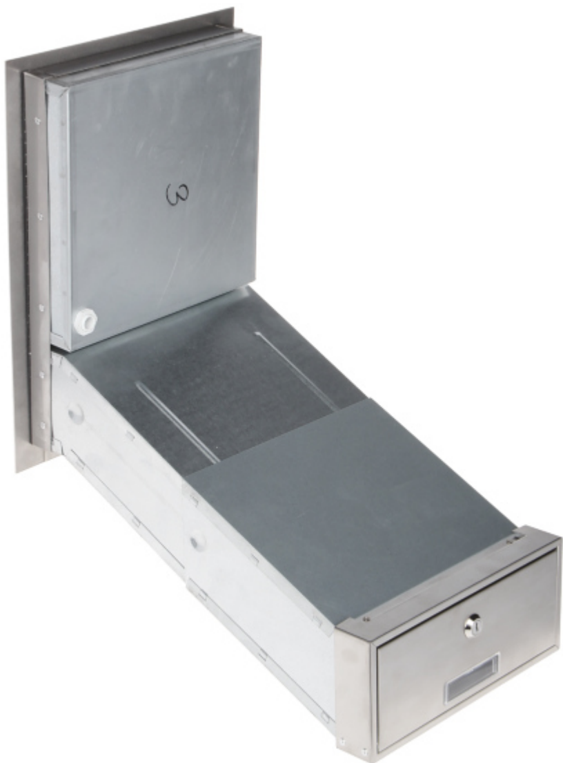
Front panel - view from the wall side: