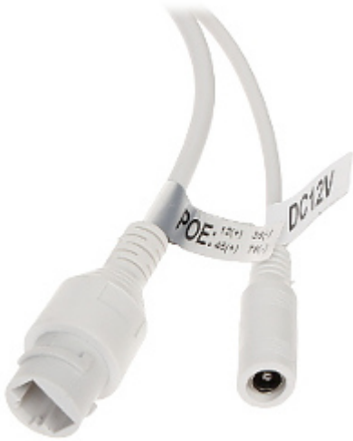
Camera and bracket dimensions: