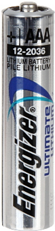
Comparison of Lithium and Alkaline batteries capacity: