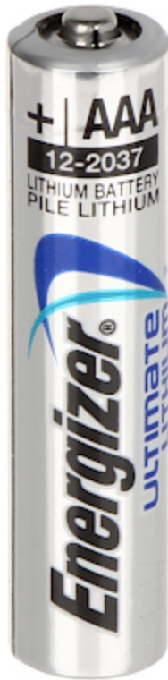
Comparison of Lithium and Alkaline batteries capacity: