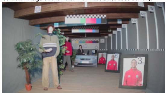
Camera image at artificial illumination (about 30Lux):