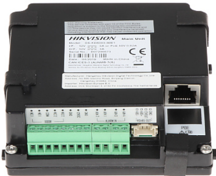
Device taken out from the housing: