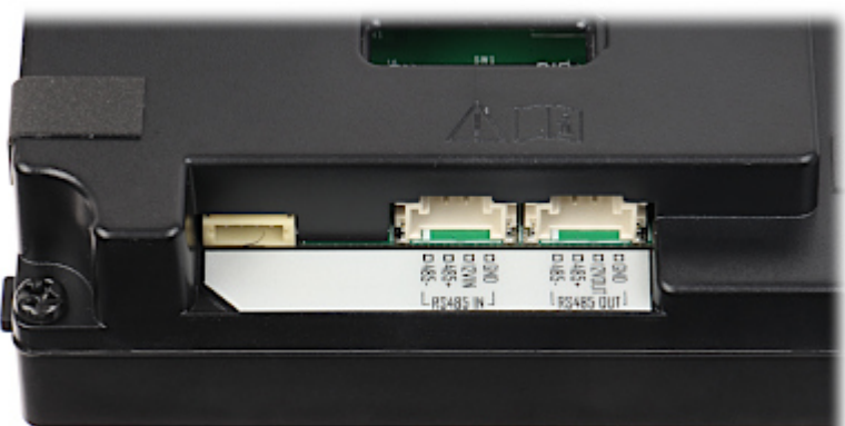
Example of application: