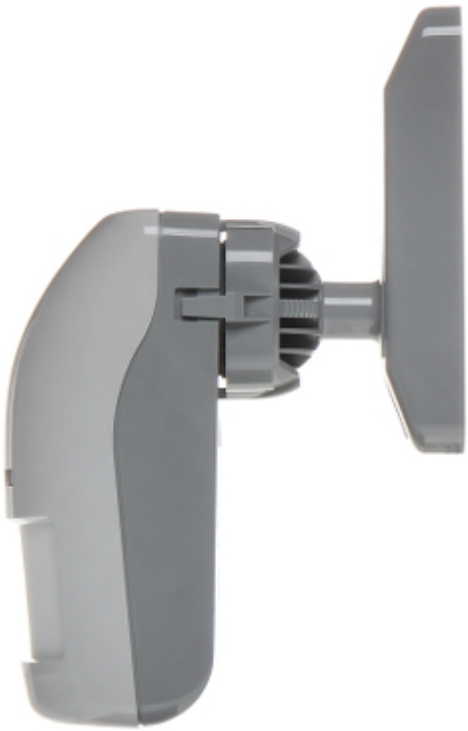
Angle type bracket: