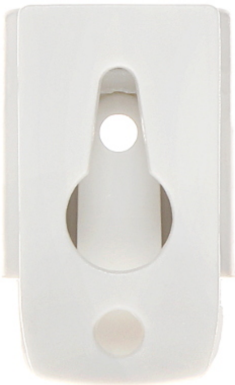
Example of application: