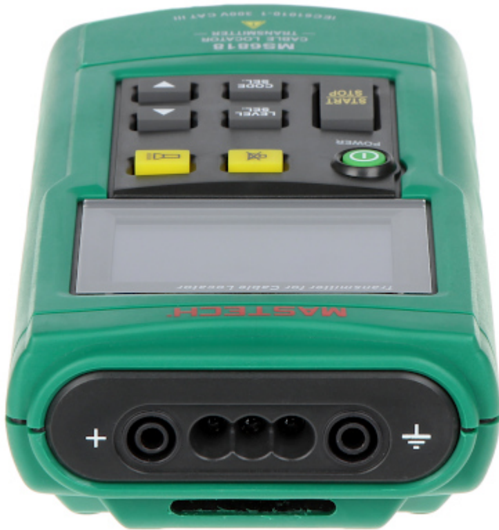
Rear view: Transmitter: