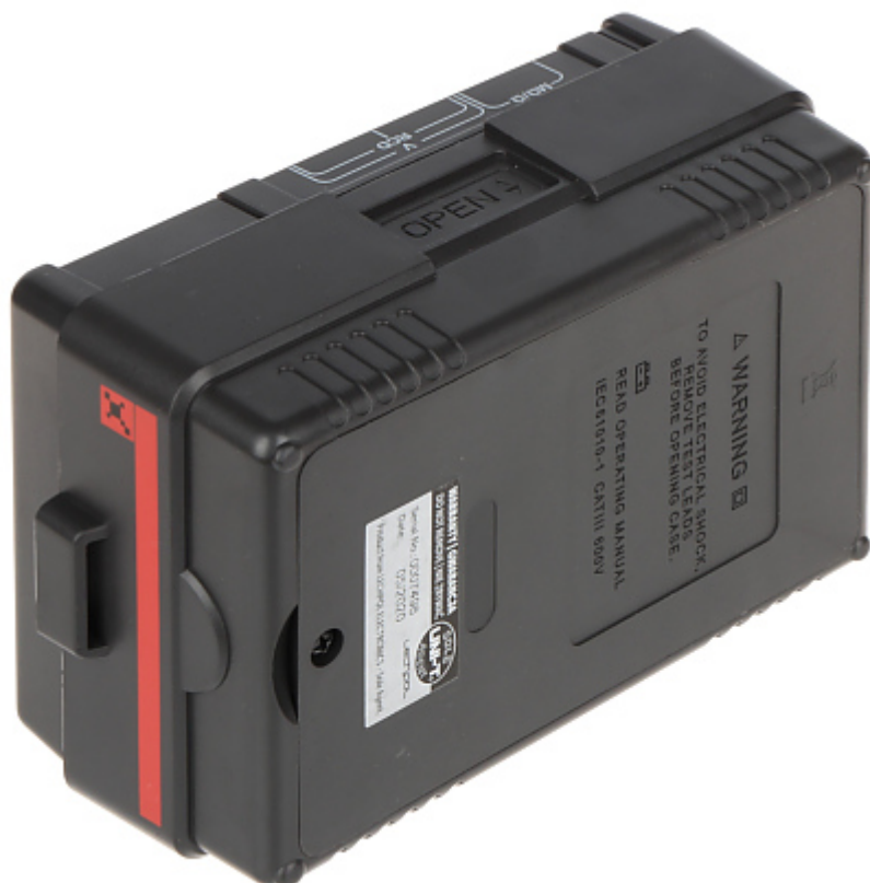
Place for batteries 6 x 1.5V AA: