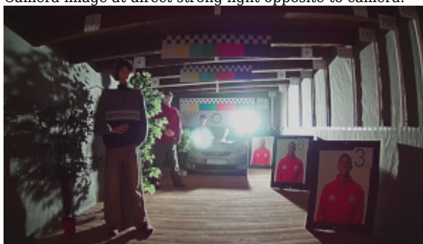
Camera image at night conditions, at different illumination values show below: