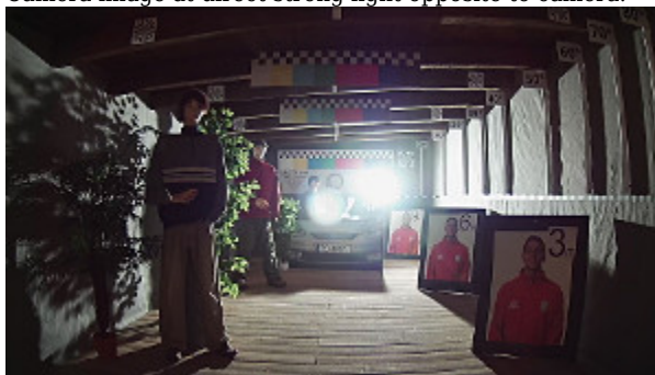
Camera image at night conditions, at different illumination values show below: