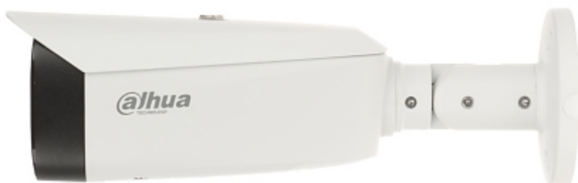
Memory card slot: