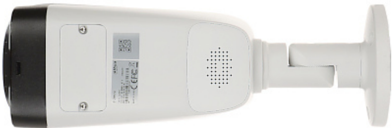
Memory card slot and "Reset" button: