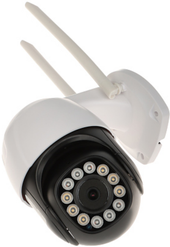
Memory card slot: