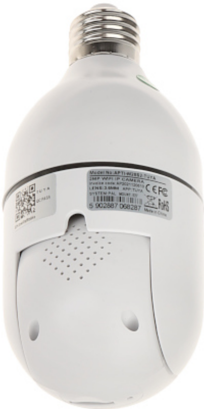
Memory card slot, micro USB and "Reset" button: