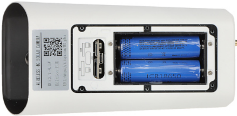
Memory card slot, USB C and "Reset" button: