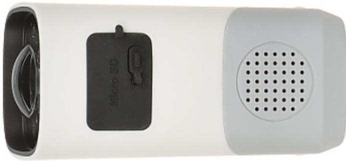
Memory card slot, micro USB and "Reset" button: