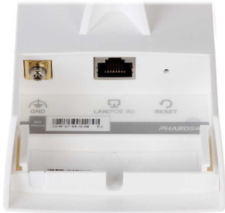
PoE Power Supply and Adapter: