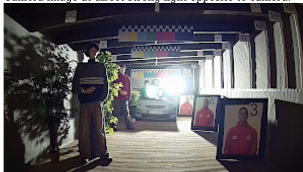
Camera image at night conditions, at different illumination values show below: