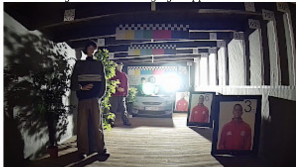
Camera image at night conditions, at different illumination values show below: