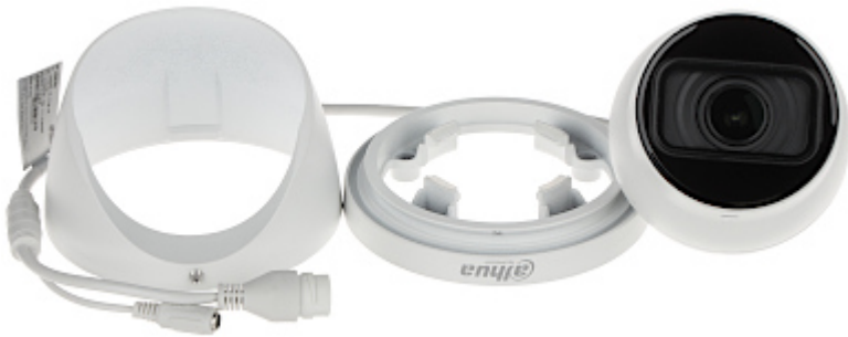
Memory card slot: