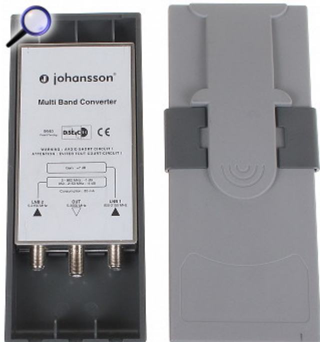
Stacker - view from the mounting side: