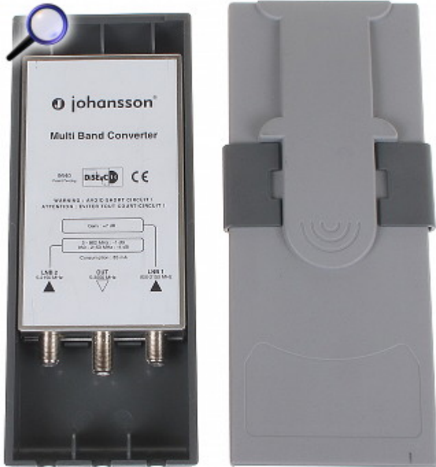
Stacker - view from the mounting side: