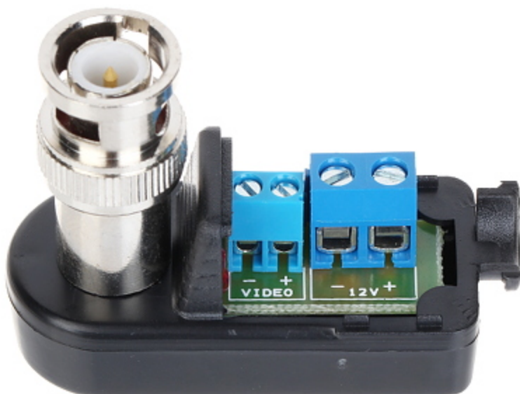
Twisted-pair cable connection wiring sequence for TR-1M/70: