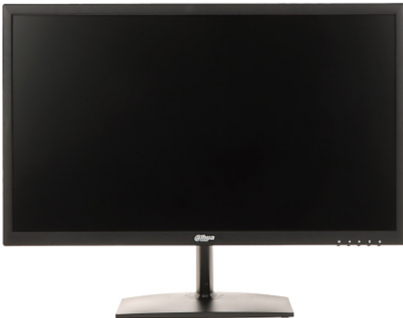
OSD menu control keys: