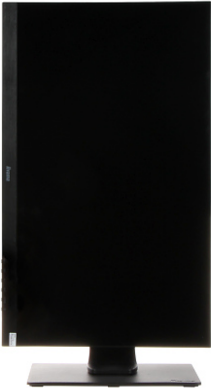
OSD menu control keys: