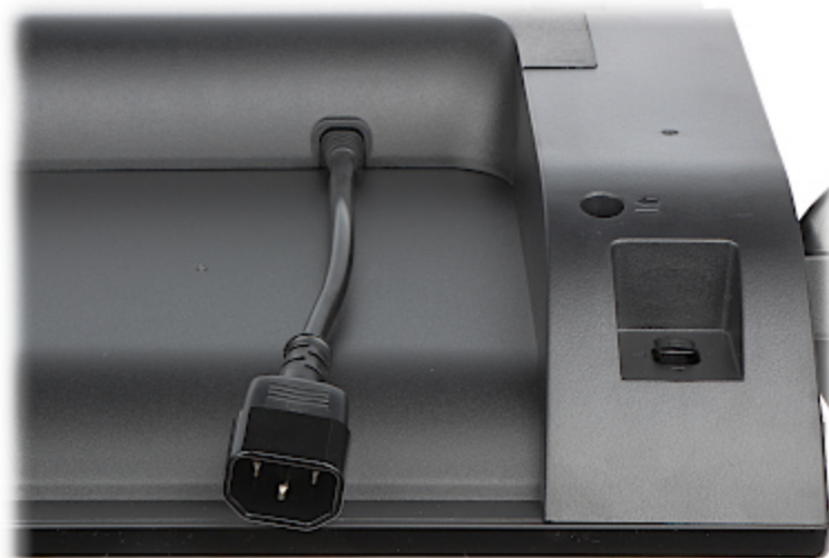
OSD menu control joystick: